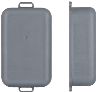
Dimensions: 88 x 48 x 26 mm

The small, durable transceiver tag features a deployment ready design that allows you to easily set up, activate and manage deployments that can scale across thousands of tracked assets.