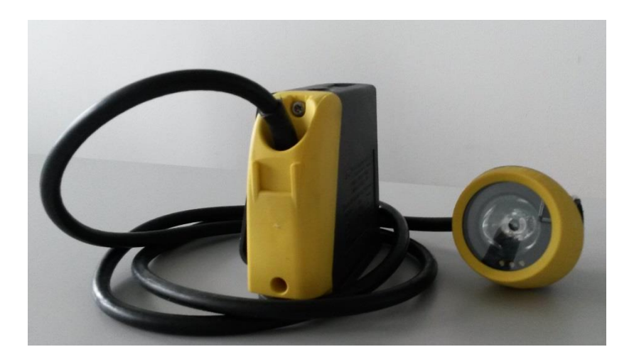
Figure 2-1 Traditional cap lamp design

The traditional cap lamp (see Figure 2-1) consists of the lamp, a ruggedized cable and a battery pack. The most popular solution for tag integration is targeting the battery pack. Space can be usually found to put the swarm bee LE module on a carrier board.