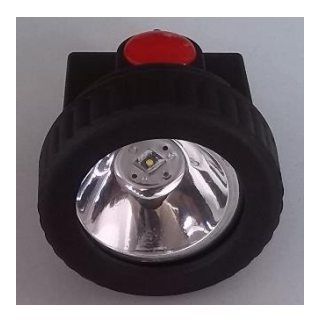
Figure 1-1 Sample cap lamp

A very popular application of swarm bee LE is to integrate it into a cap lamp (see Figure 1-1). The cap lamp, carried by underground workers, can be used as a tag in a real time location system (RTLS) and collision avoidance solutions (CAS).