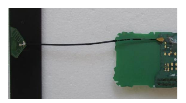
Figure 3-4 Mounting of mini PCB antenna