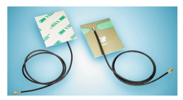
Figure 3-5 Thin PCB antenna

Another PCB antenna is a thin PCB antenna as shown in Figure 3-5 from TE (Tyco Electronics Corporation). With relative large mounting area, this antenna can be sticked directly onto a PCB ground plane.