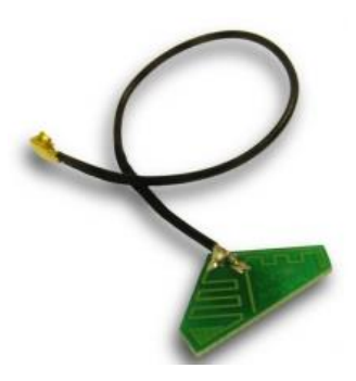
Figure 3-3 mini PCB antenna from RF Solutions

The antenna in the figure below is a kind of mini PCB antenna from RF Solutions. It is supplied with a U.FL connector and 3M adhesive fixing for mounting on any non-conductive surface, e.g. plastic. Figure 3-4 shows one example of mounting the antenna.