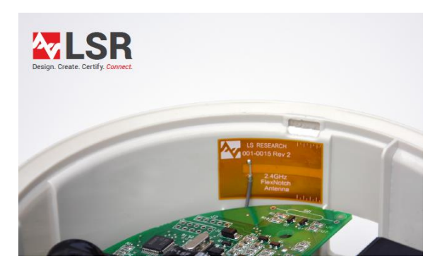
Figure 3-6 FlexNotch™ from LSR