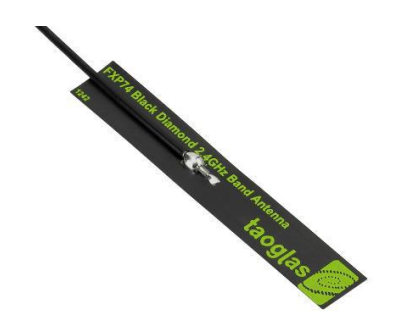
Figure 3-2 Stickable band antenna from Taoglas

Figure 3-2 shows a kind of stickable antenna FXP.74 from Taoglas, which can be mounted easily by simply "peeling and sticking". The FXP.74 is the ideal all-round antenna solution for fitting into narrow spaces and still maintaining high performance, for example on the inside top or adjacent side applied directly to the plastic housing of LCD monitors, tablets, smartphones, small AP routers, etc.