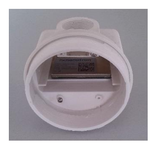
Figure 2-2 Sample cordless cap lamp tag (3D printing model)

Note: Enough space for antenna and swarm bee LE module must be planned during design of the housing.