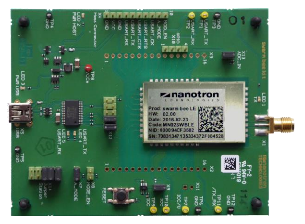
swarm bee LE V2 DK Plus Board

The swarm bee Development Kit Plus (DK+) is a useful tool for users to get quick acquaintance with the basic functionality of swarm bee LE. The Development Kit Plus consists of several DK+ Boards (see figure below) with antenna, swarm PC Tool which demonstrates ranging application, sensor monitor as well as to use the API via GUI and sniffer which allows to monitor the air interface.